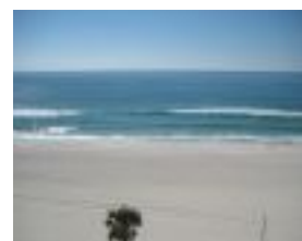
The Gulf of Mexico